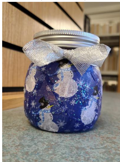
On Thursday, December 1 at 6:00 p.m., Nesmith Library card

holders, ages 18 and up, are invited to create a glowing holiday luminary using tissue paper and glass jars. All materials will be provided, and space is limited, so register early!